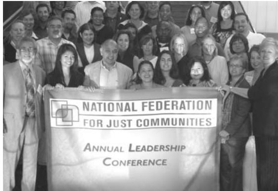
Attendees of the NFJC Inaugural Leadership Conference gathered in New Brunswick, New Jersey.

One of the highlights of the event was the work put in to the creation of our strategic plan for the next four years. This key plan will go along way in ensuring that NFJC will serve as a true resource for member organizations such as Just Communities Central Coast. Ultimately, we will see the development of a vital network for like-minded organizations working across America to bring the values of diversity, inclusion, and social justice to our communities, schools, workplaces, and institutions.